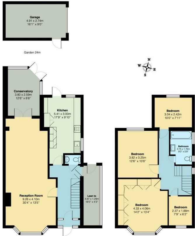
Total Area: 147.3 m 2 ... 1585 ft 2 All measurements are approximate and for display purposes only.

Garage 16'1" x 8'11" Garden 78'8" Conservatory 12'5" x 8'5" Kitchen 17'8" x 9'10" WC Reception Room 30'4" x 13'5" Lean to 15'11" x 4'2" Bedroom 9'11" x 7'11" Bedroom 12'6" x 10'7" Bathroom 9'0" x 5'9" Bedroom 14'2" x 13'3" Bedroom 7'9" x 6'2"