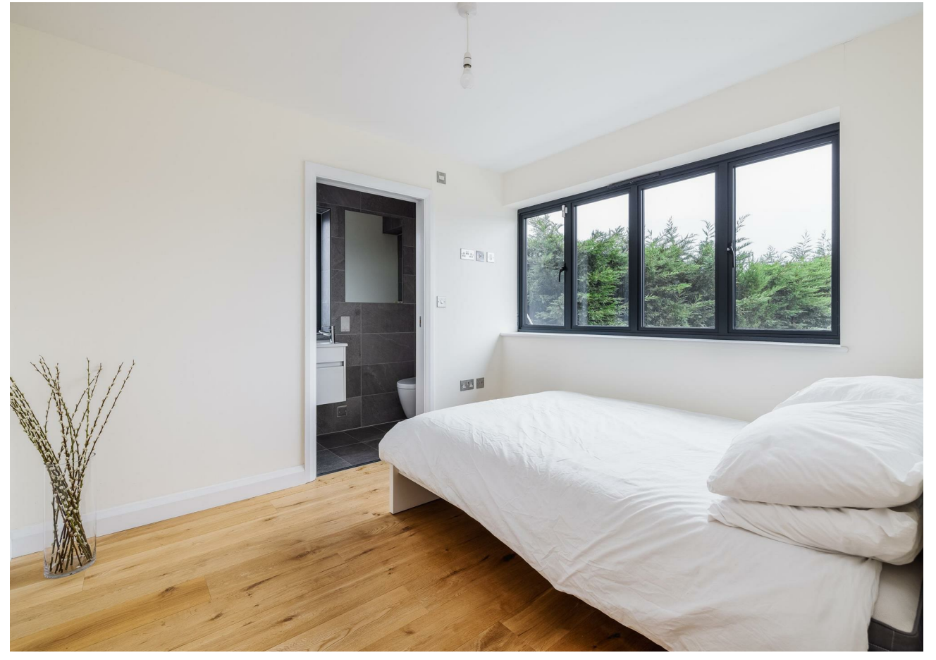
FOLLOW US → @STOWBROTHERS STOWBROTHERS.COM