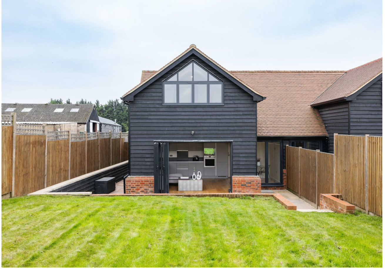
FOLLOW US → @STOWBROTHERS STOWBROTHERS.COM