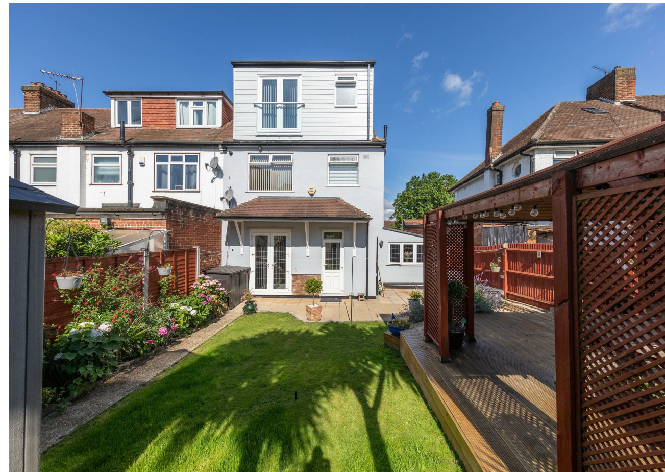
Garden 32'9" x 32'9"