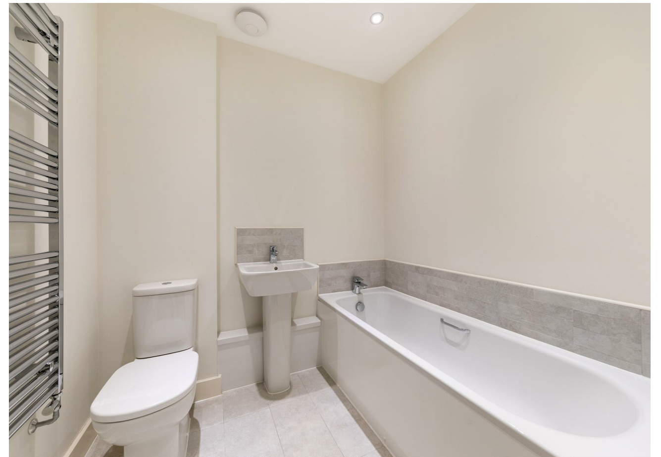
Ensuite 6'10" x 4'8"