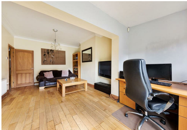
Reception Room 13'6" x 12'10"