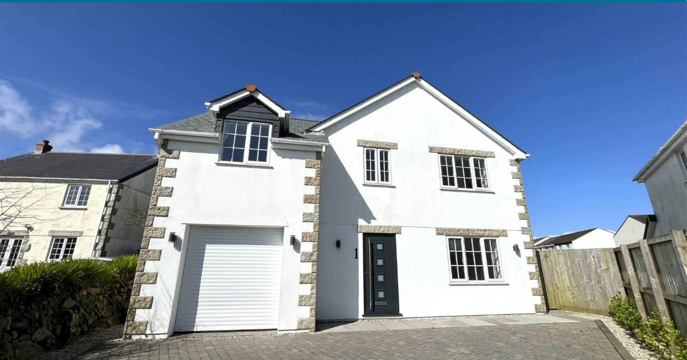
1 Landithy Gardens Churchway, Penzance, TR20 8FH £1,995 Per month