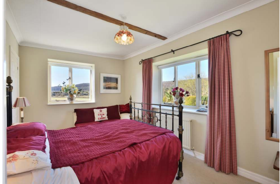
Three further bedrooms with supporting large family bathroom