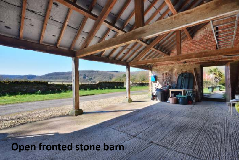
Open fronted stone barn