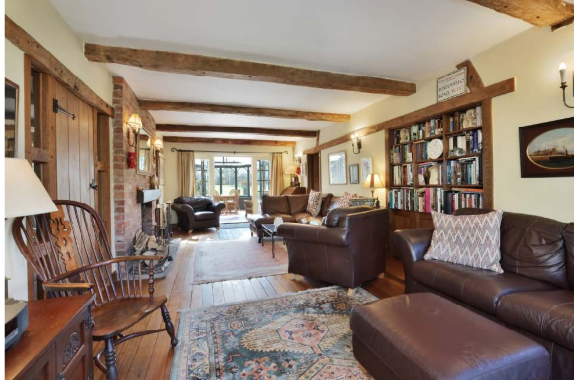
Main living room leading through to the conservatory and dining room