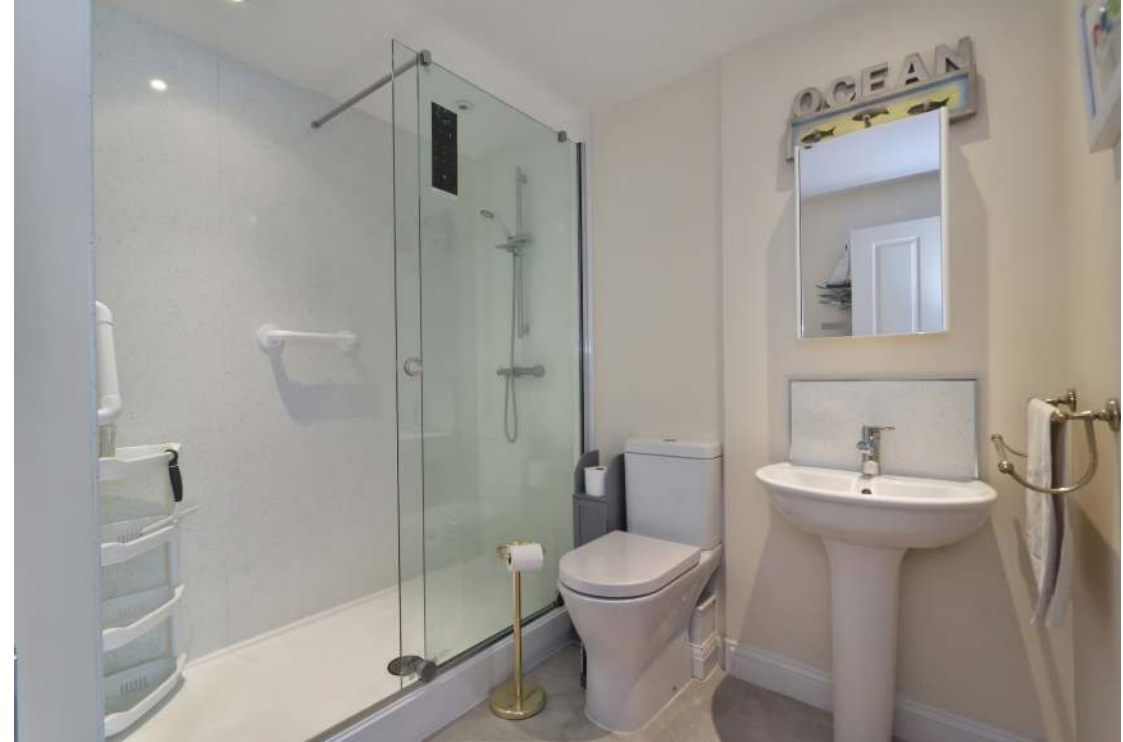
Two/three bedrooms — two with en suite shower rooms