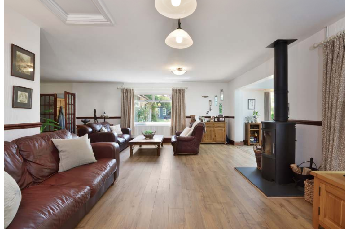
Dining room / living room / kitchen/breakfast room