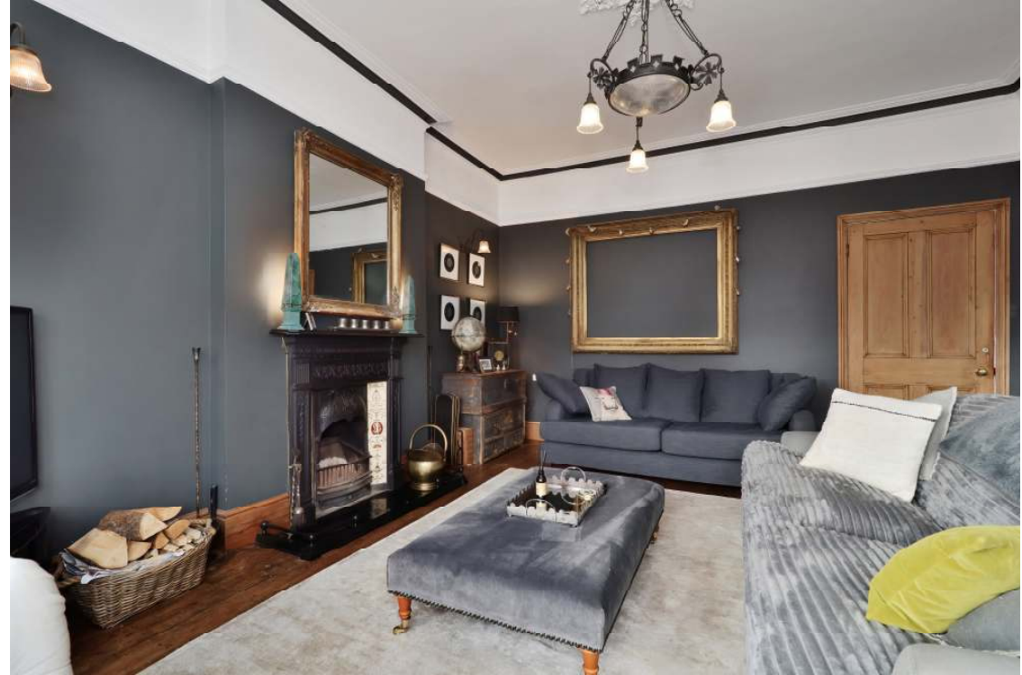
Drawing room / dining room and kitchen/breakfast room overlooking the gardens