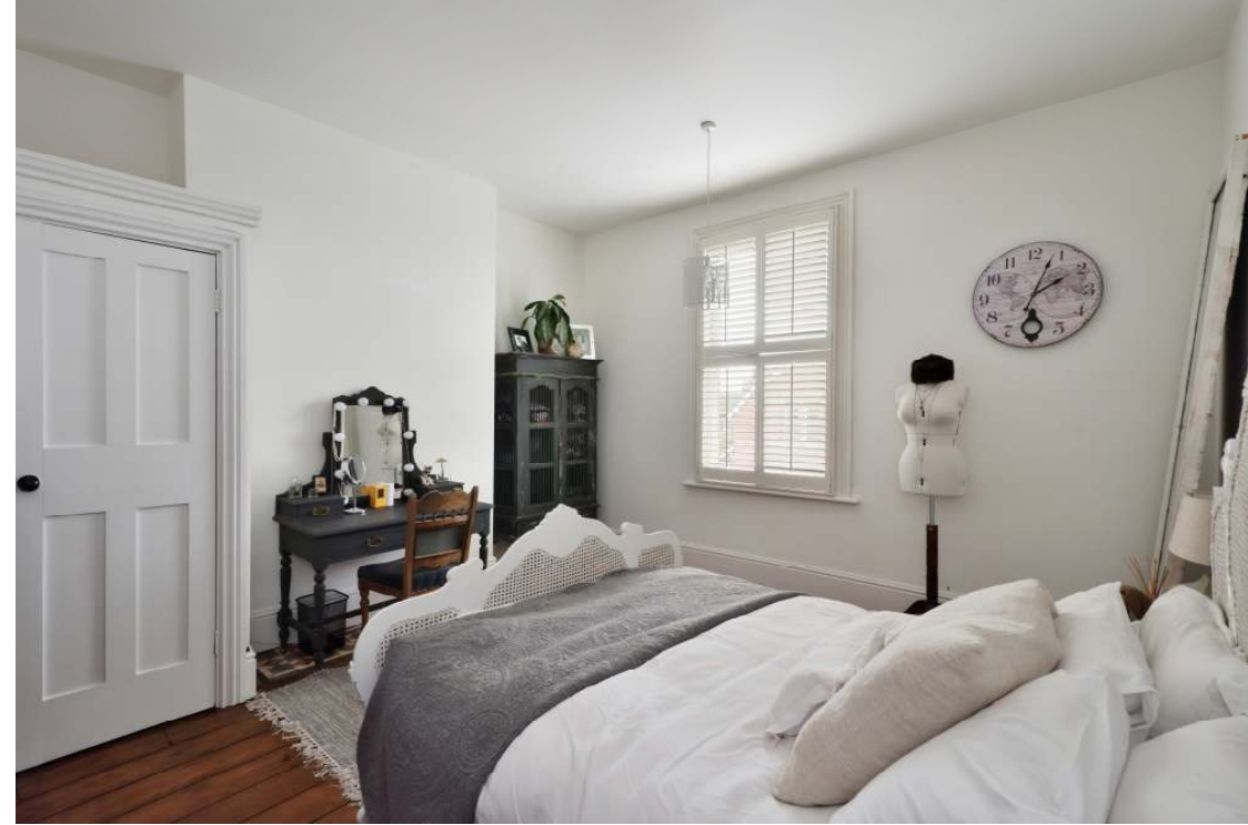
Three further bedrooms with a supporting bathroom