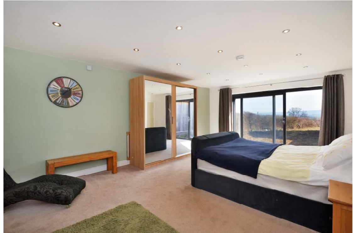
Three of four bedrooms with supporting family bathroom