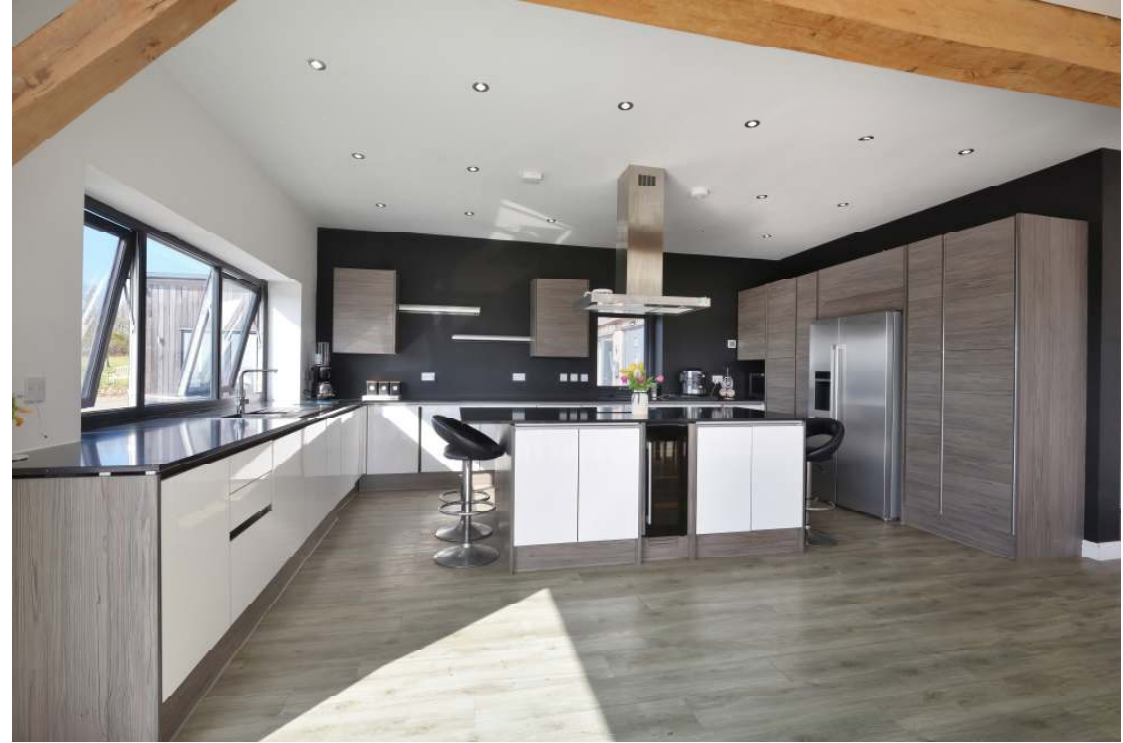
Breakfast Room leading through to living room