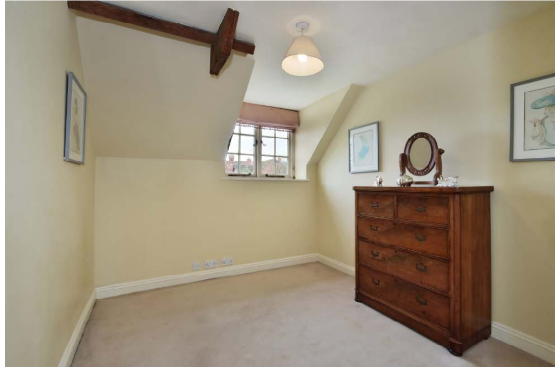
Three bedrooms with supporting bathroom