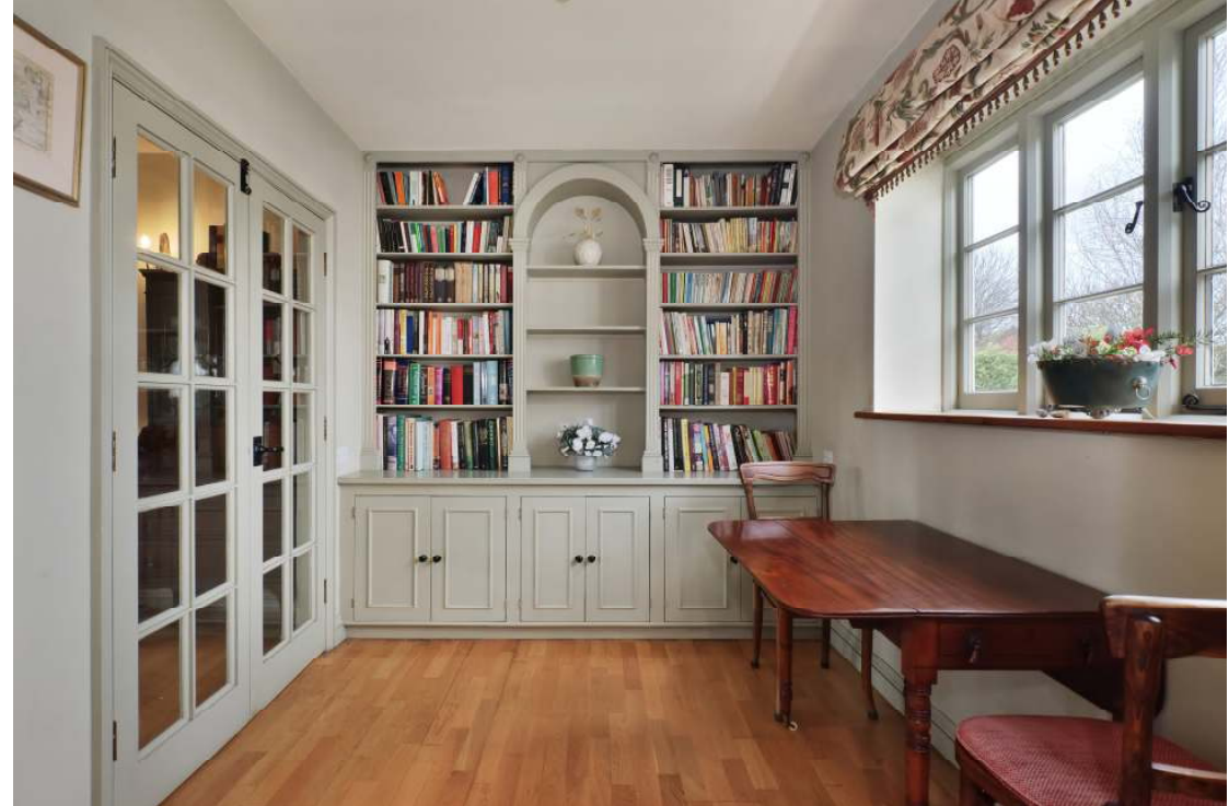
Main living room, breakfast room and adjoining kitchen