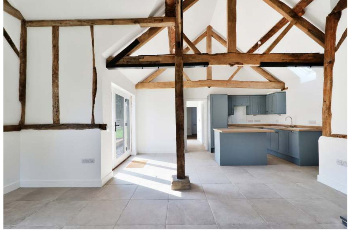
Open plan living room/kitchen with supporting utility room