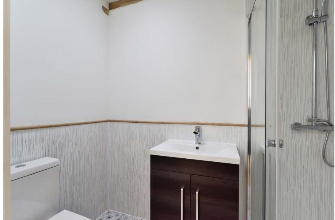
Two double bedrooms one with en suite and supporting bathroom