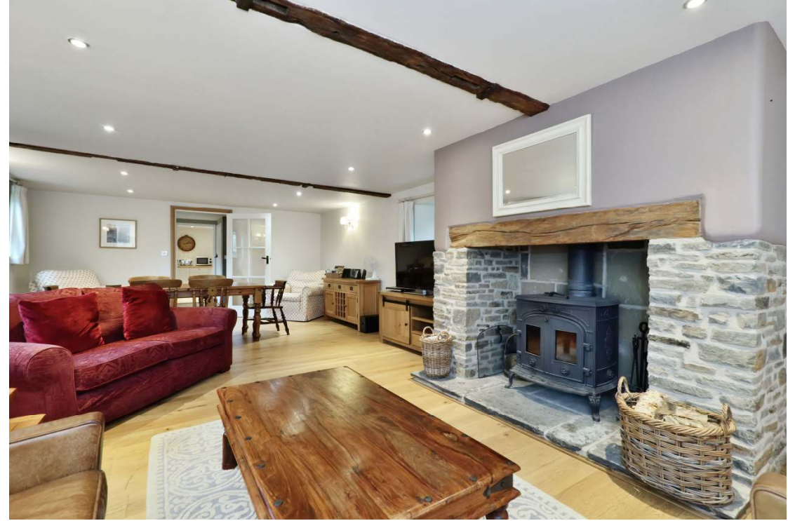
The Old Barn - three bedroom conversion with two washrooms and character charm