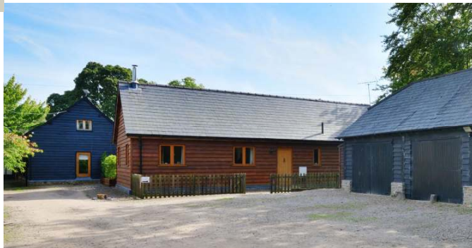
The Annex above, with four bay garage/car port to right