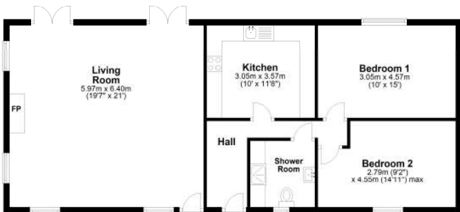
Little Quebb-The Annexe Detached Approx. 87.7 sq metres (943.9 sq feet)

Floorplans are for guidance only and are not to scale