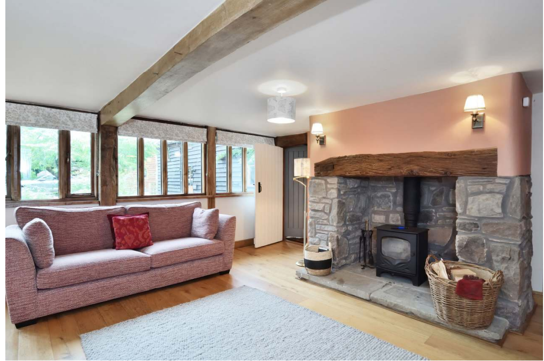
The Granary - two bedroom conversion with character and modern conveniences