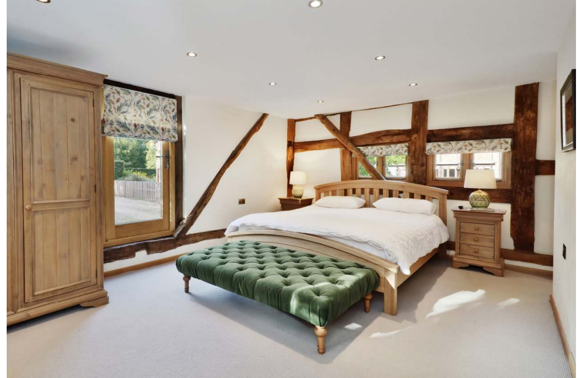
Five double bedrooms overall + four bath/shower rooms