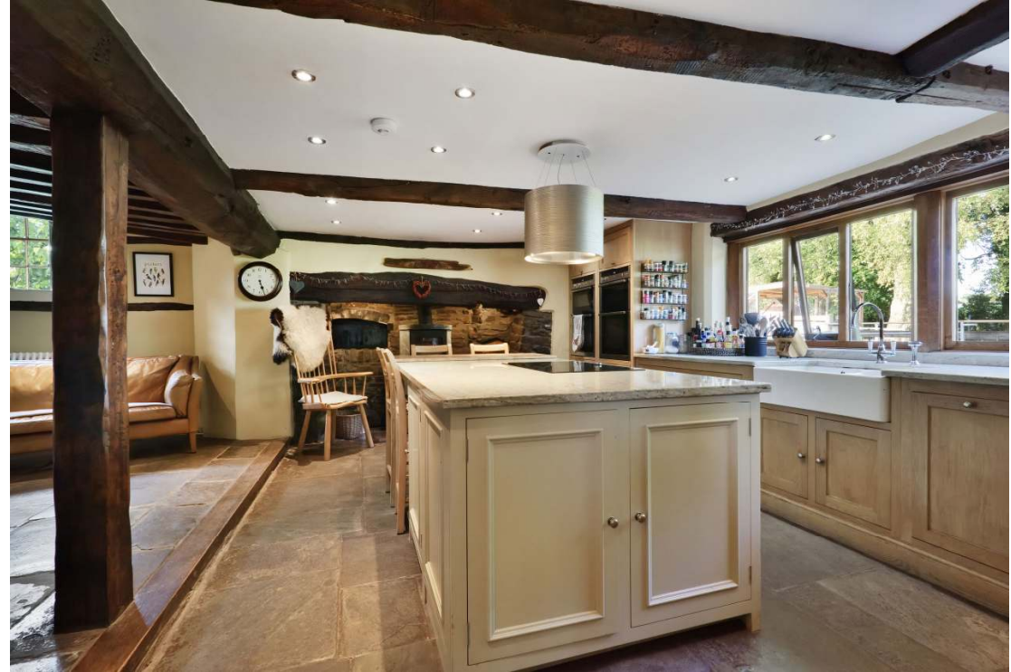
Wonderful kitchen/breakfast room with supporting utility room