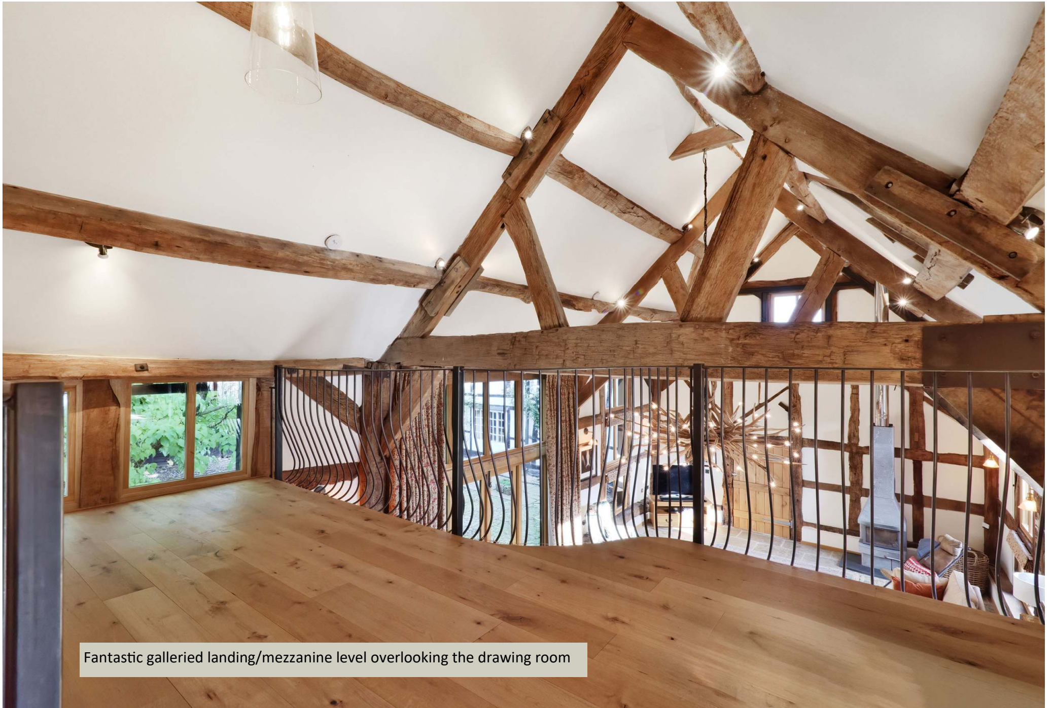
Fantastic galleried landing/mezzanine level overlooking the drawing room