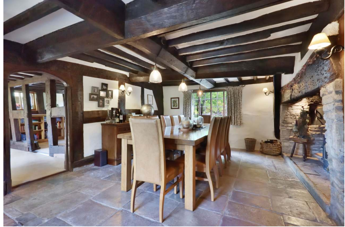
The main farmhouse is packed with character features and ample reception space