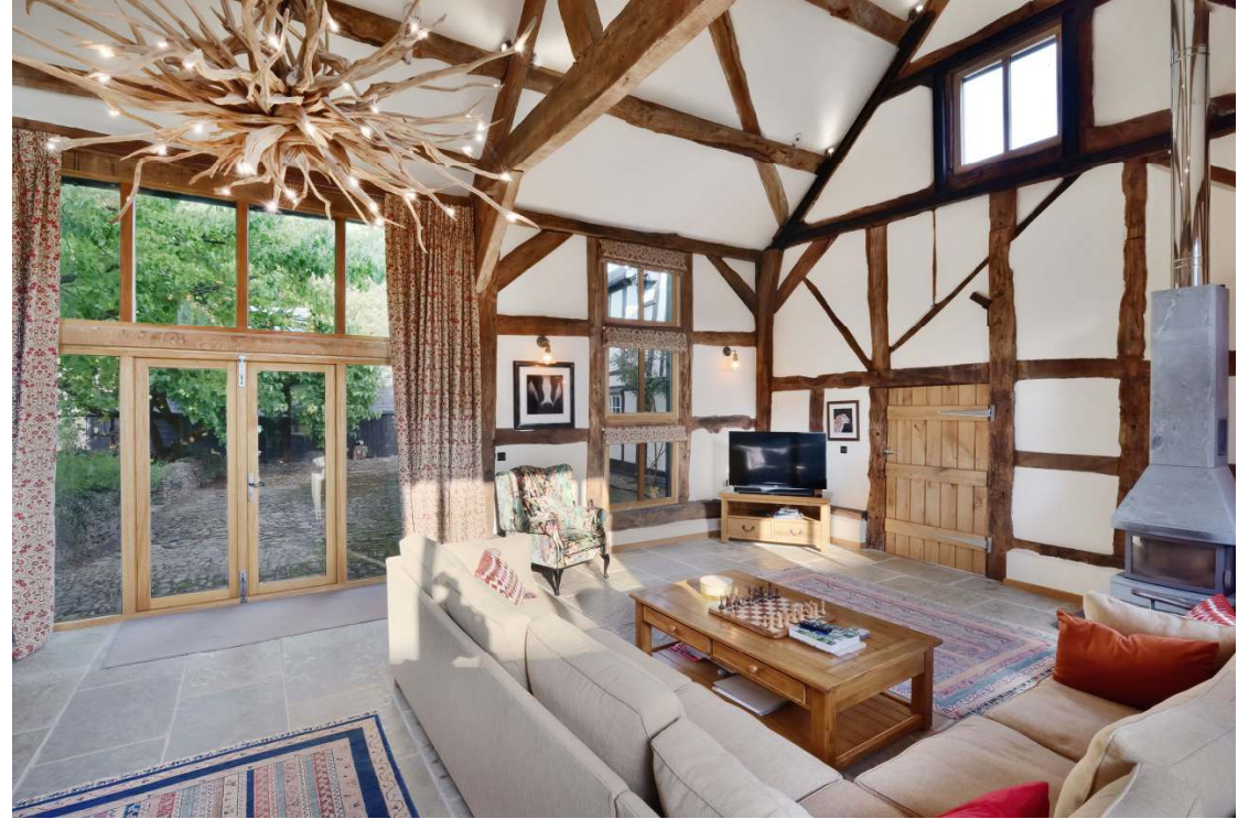
Impressive drawing room with games room off