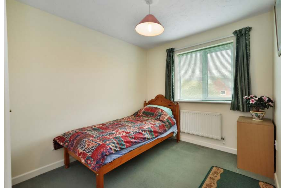
Bedrooms with supporting family bathroom