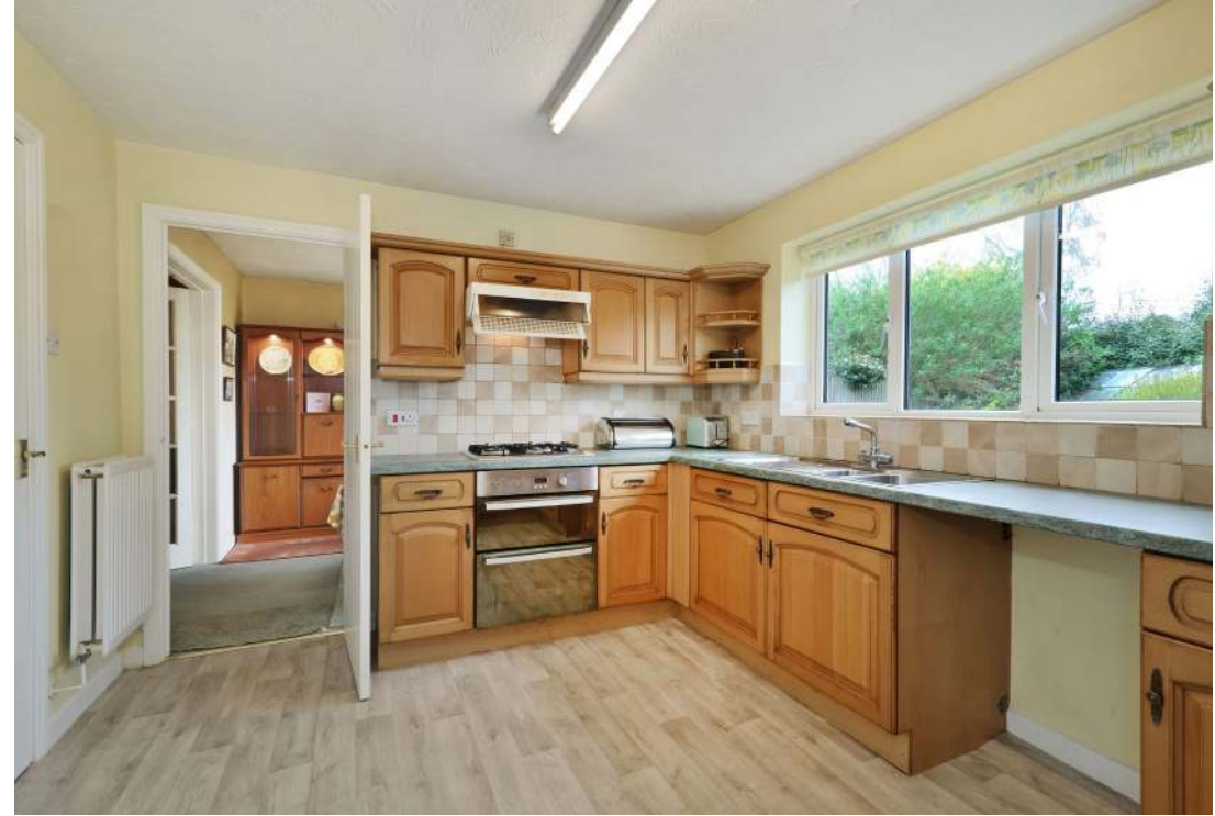
Kitchen with adjoining dining room leading on to the rear garden