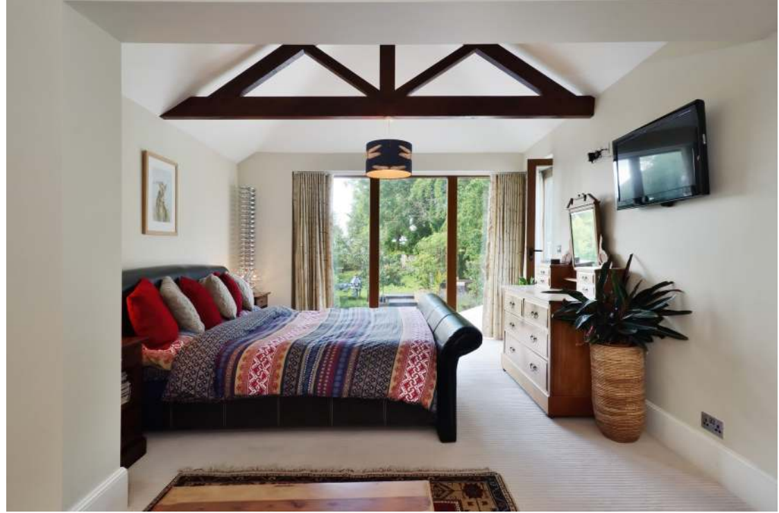
Master bedroom suite with luxury en suite bathroom and a hidden private balcony