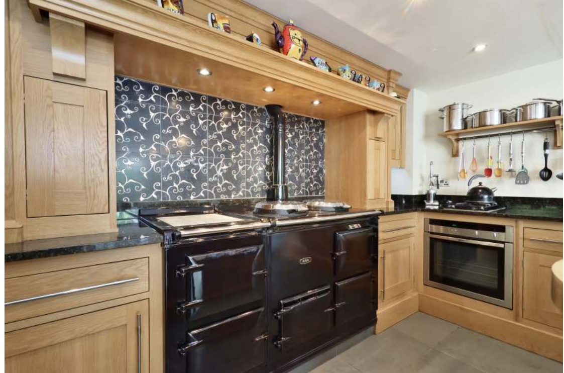
Kitchen / family room with bifold doors leading on to the large sun terrace