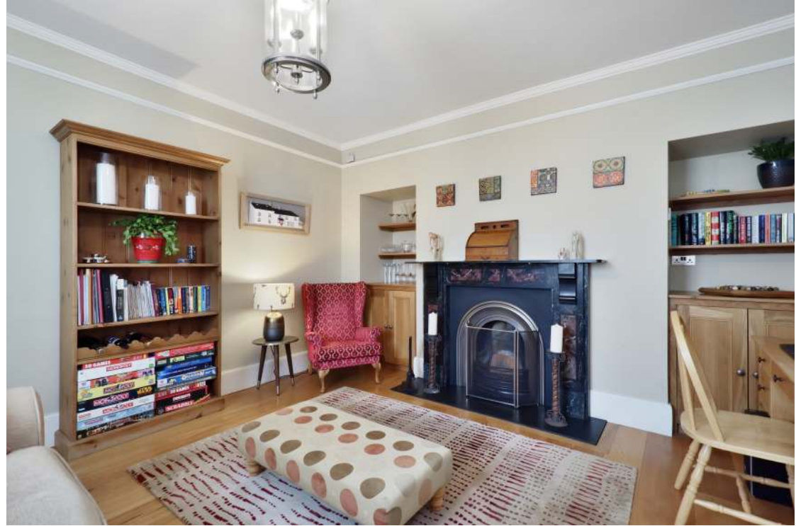
Ground floor living room and a separate sitting room