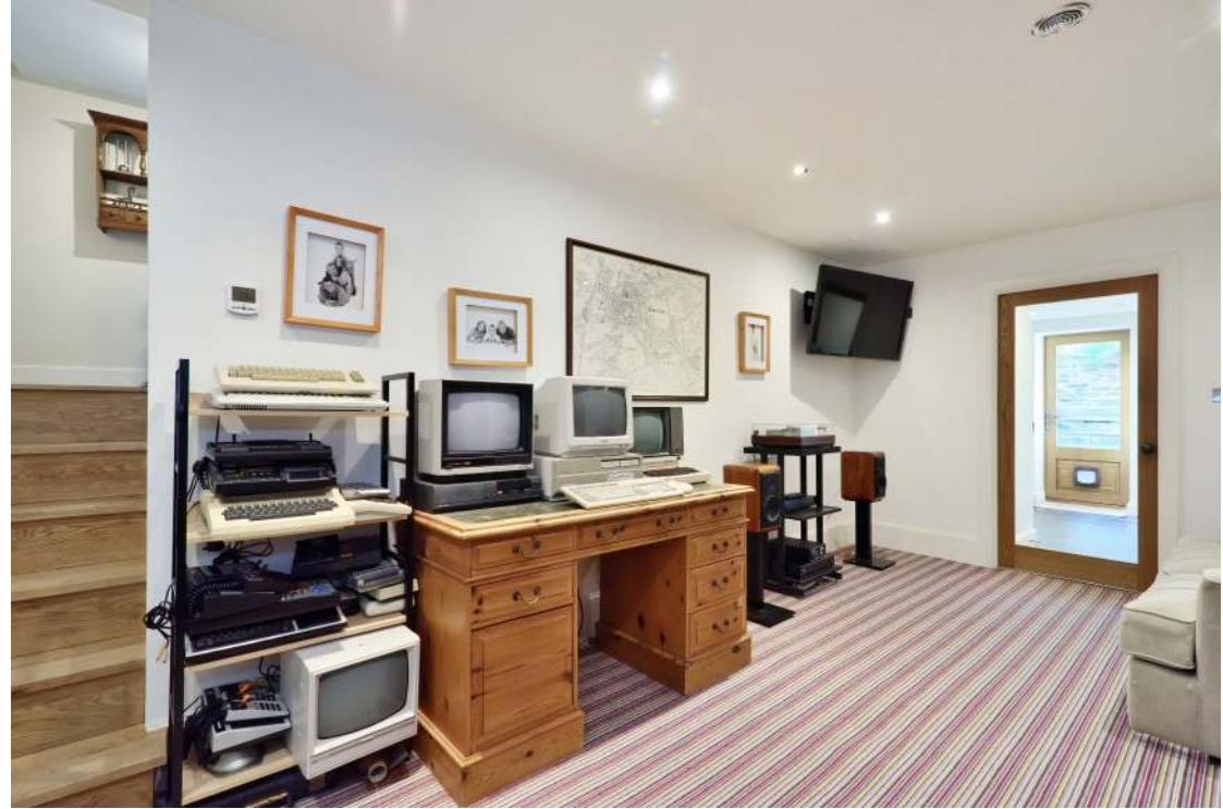
Large playroom / office and a impressive first floor drawing room full of character