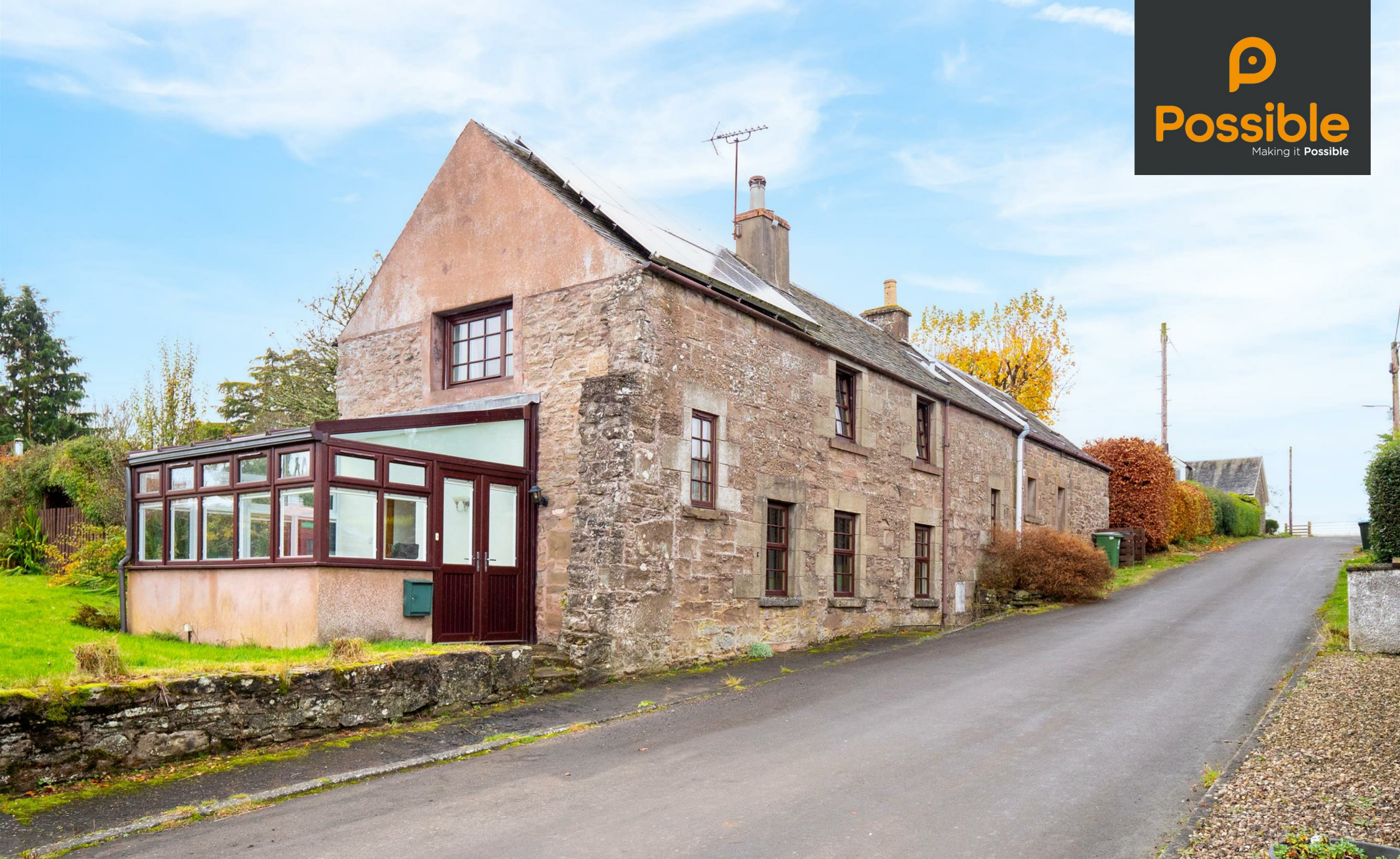
The Old Post Office Harrietfield, Perth, PH1 3TD Offers over £385,000