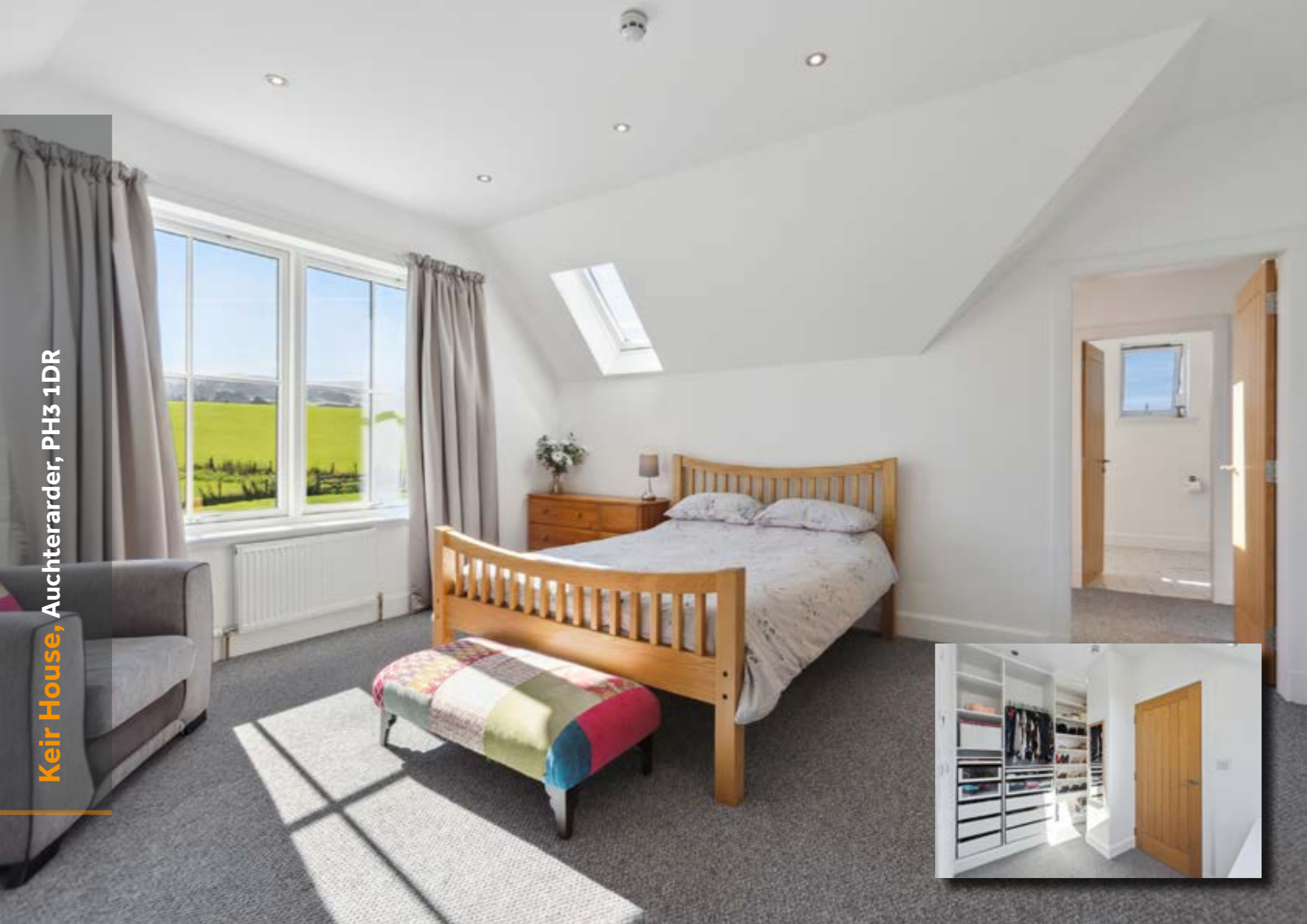
Keir House, Auchterarder, PH3 1DR