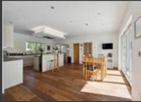
Keir House, Auchterarder, PH3 1DR