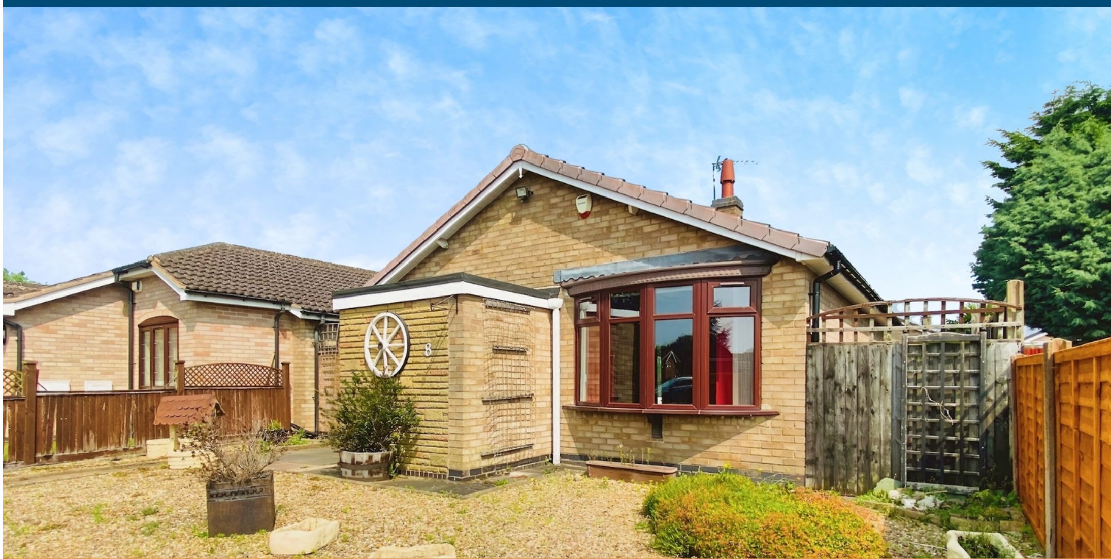
Thatchers Corner, East Goscote, LE7