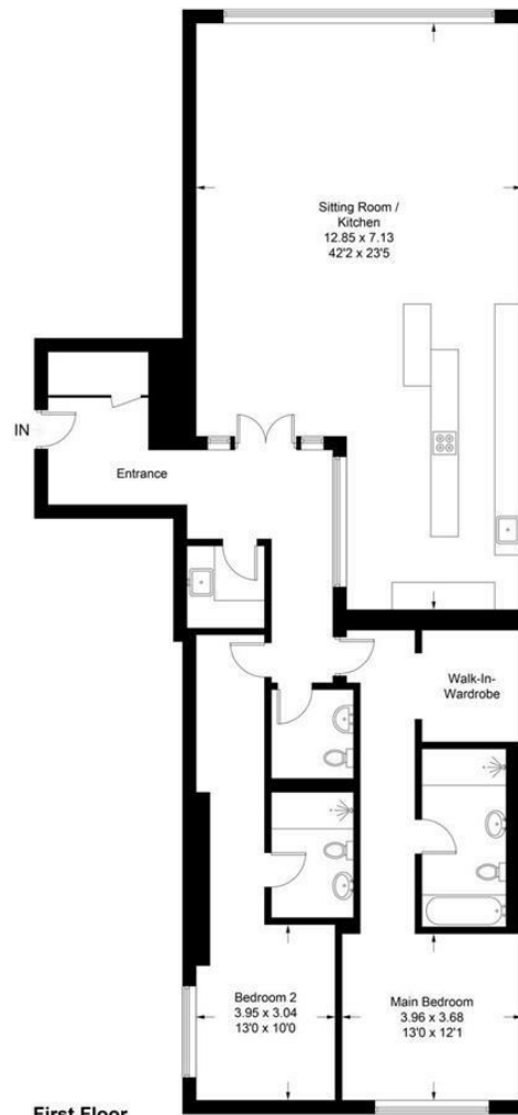
Illustration for identification purposes only, measurements are approximate, not to scale. floorplansUsketch.com © (ID1065727)