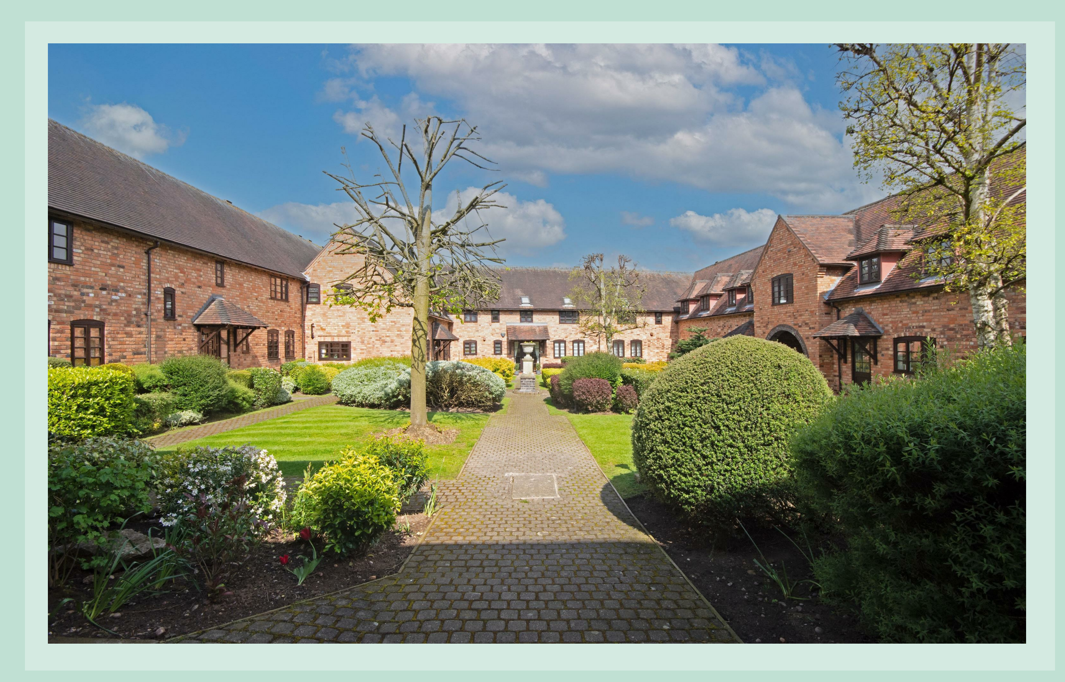
4, OLD LANGLEY HALL, OX LEYS SUTTON COLDFIELD