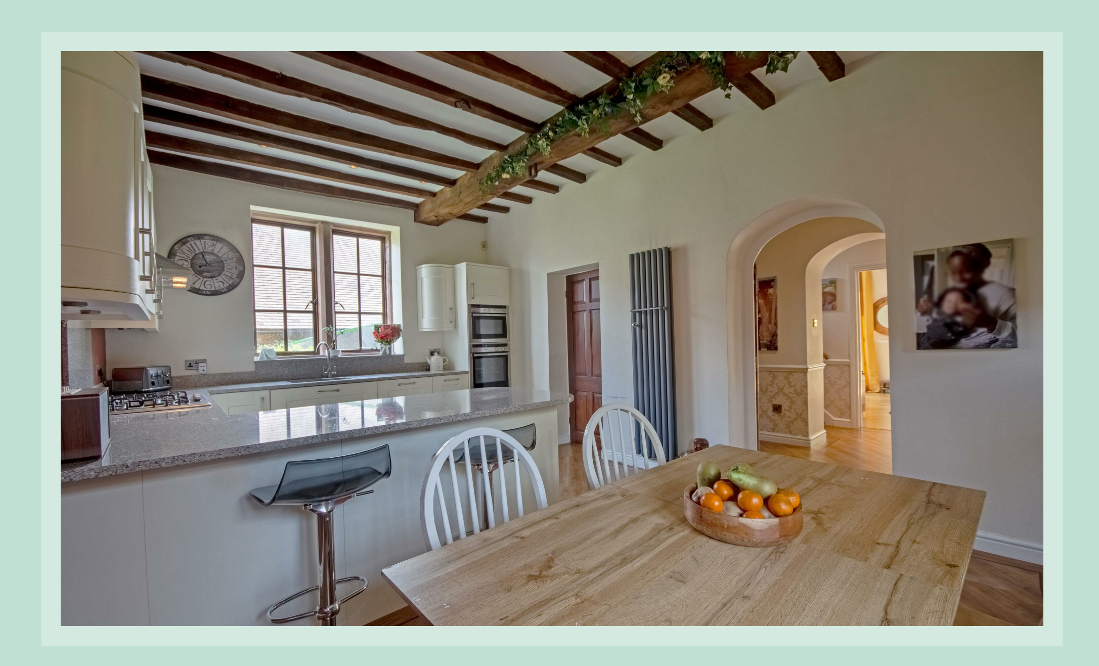
4, OLD LANGLEY HALL, OX LEYS SUTTON COLDFIELD