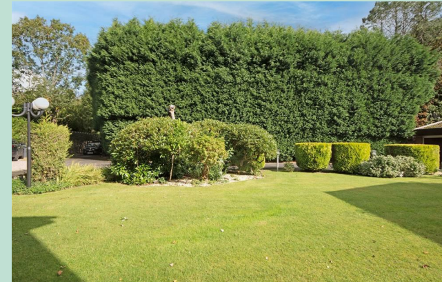
SUKHMANI, ENDWOOD DRIVE SUTTON COLDFIELD