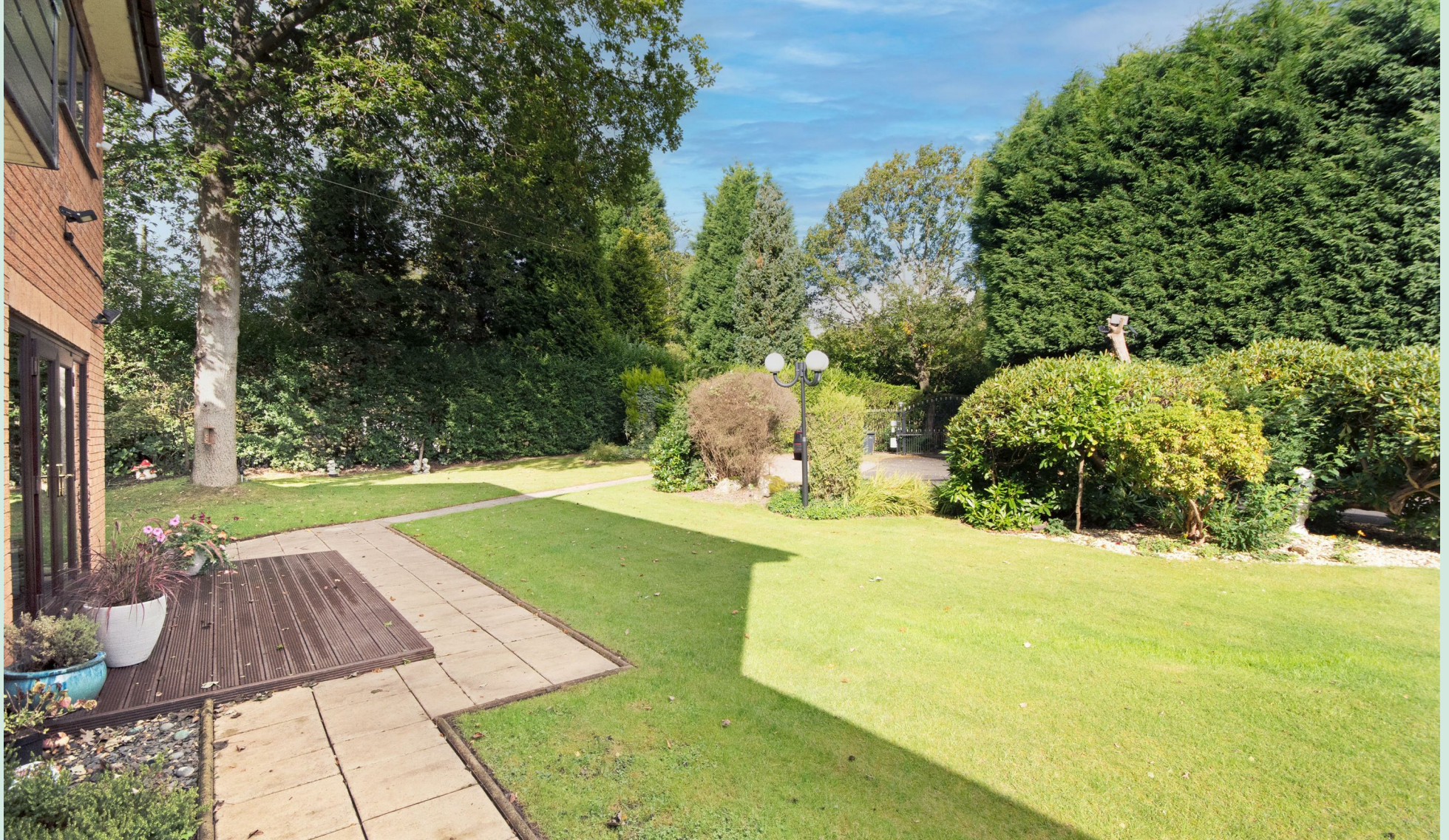
SUKHMANI, ENDWOOD DRIVE SUTTON COLDFIELD