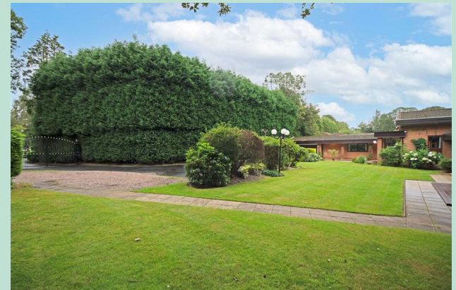
SUKHMANI, ENDWOOD DRIVE SUTTON COLDFIELD