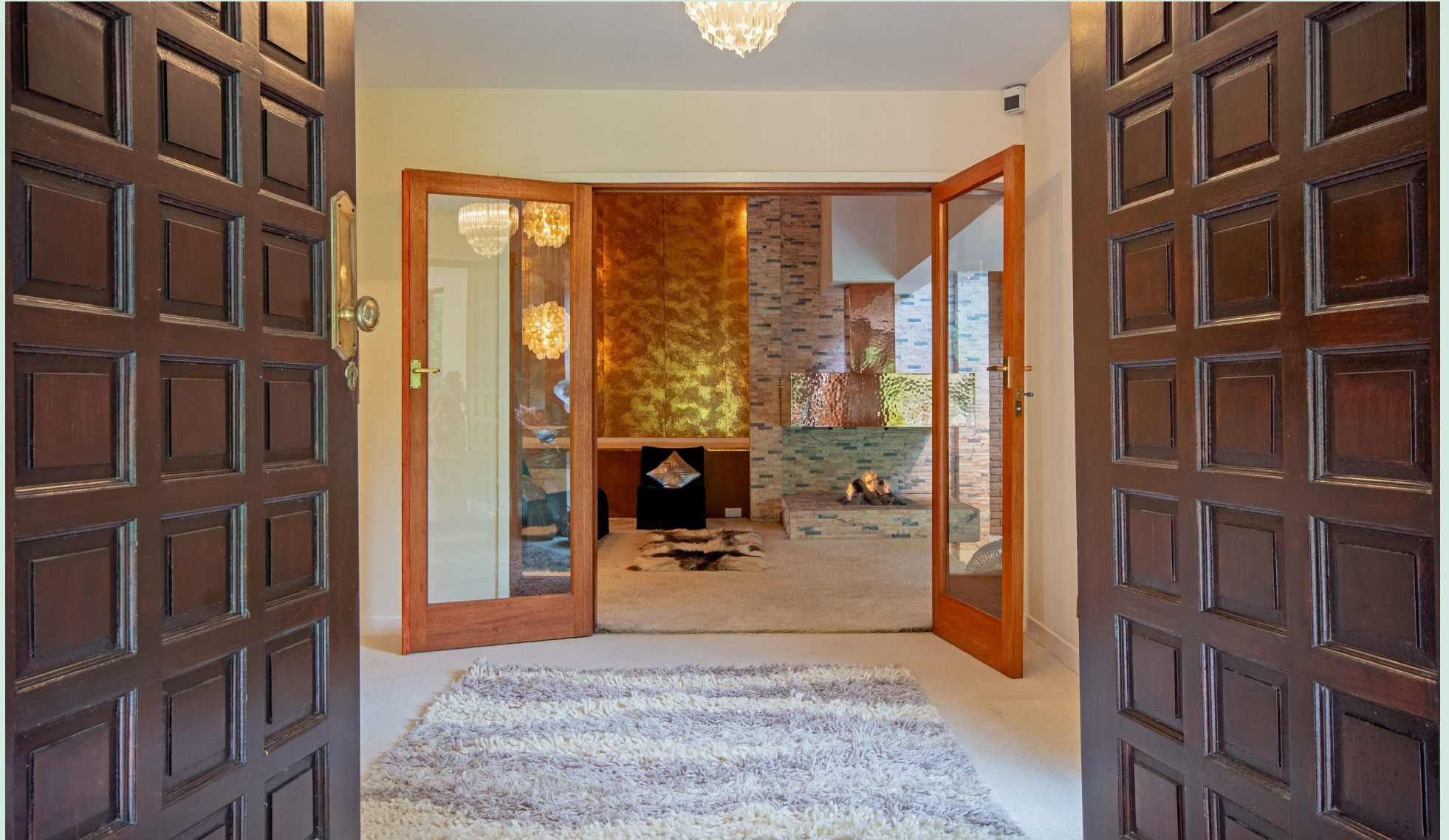
SUKHMANI, ENDWOOD DRIVE SUTTON COLDFIELD