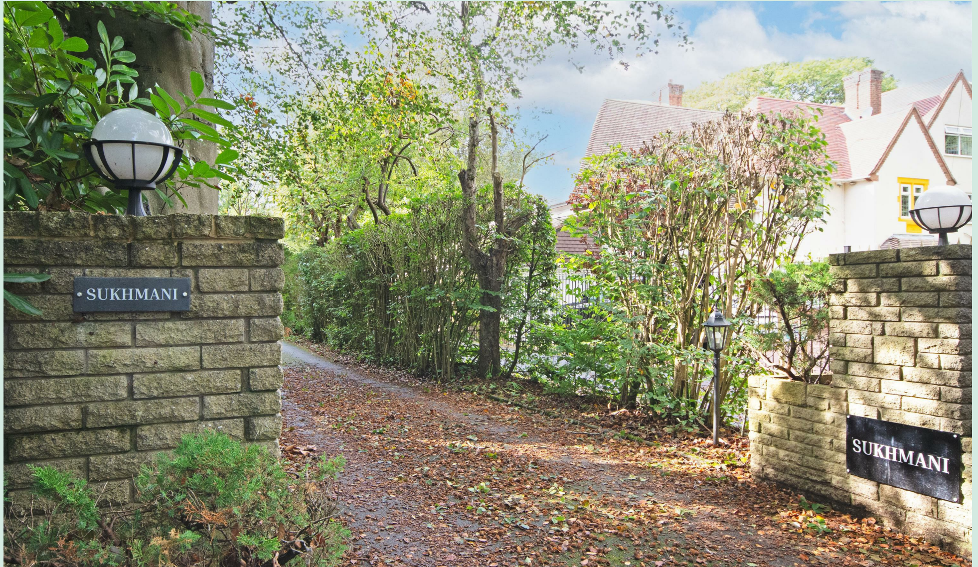
SUKHMANI, ENDWOOD DRIVE SUTTON COLDFIELD