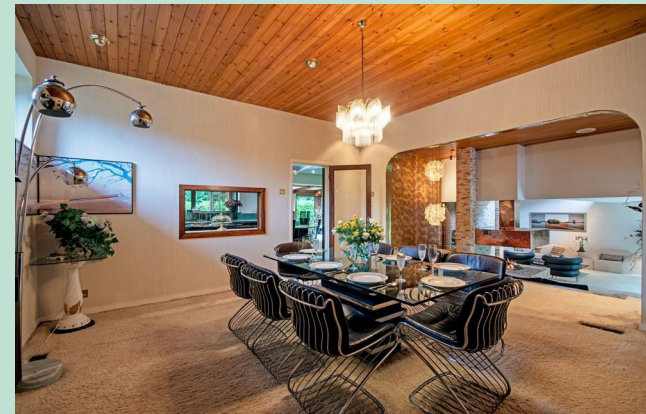
SUKHMANI, ENDWOOD DRIVE SUTTON COLDFIELD