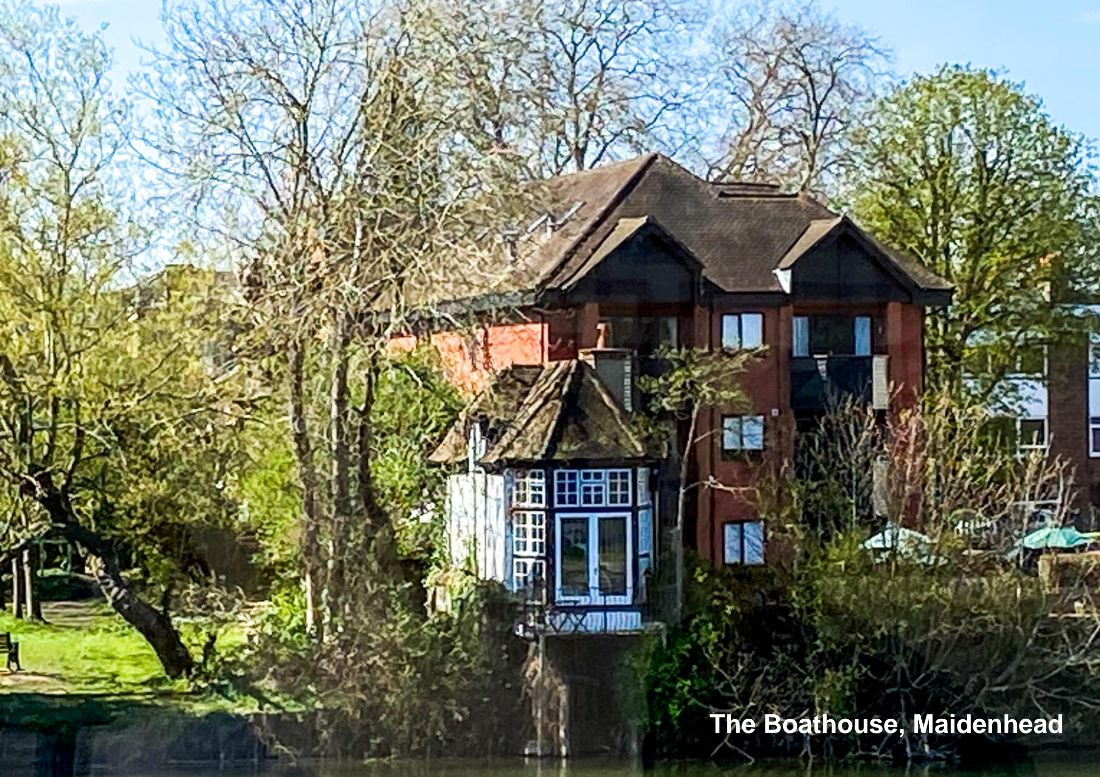
The Boathouse, Maidenhead