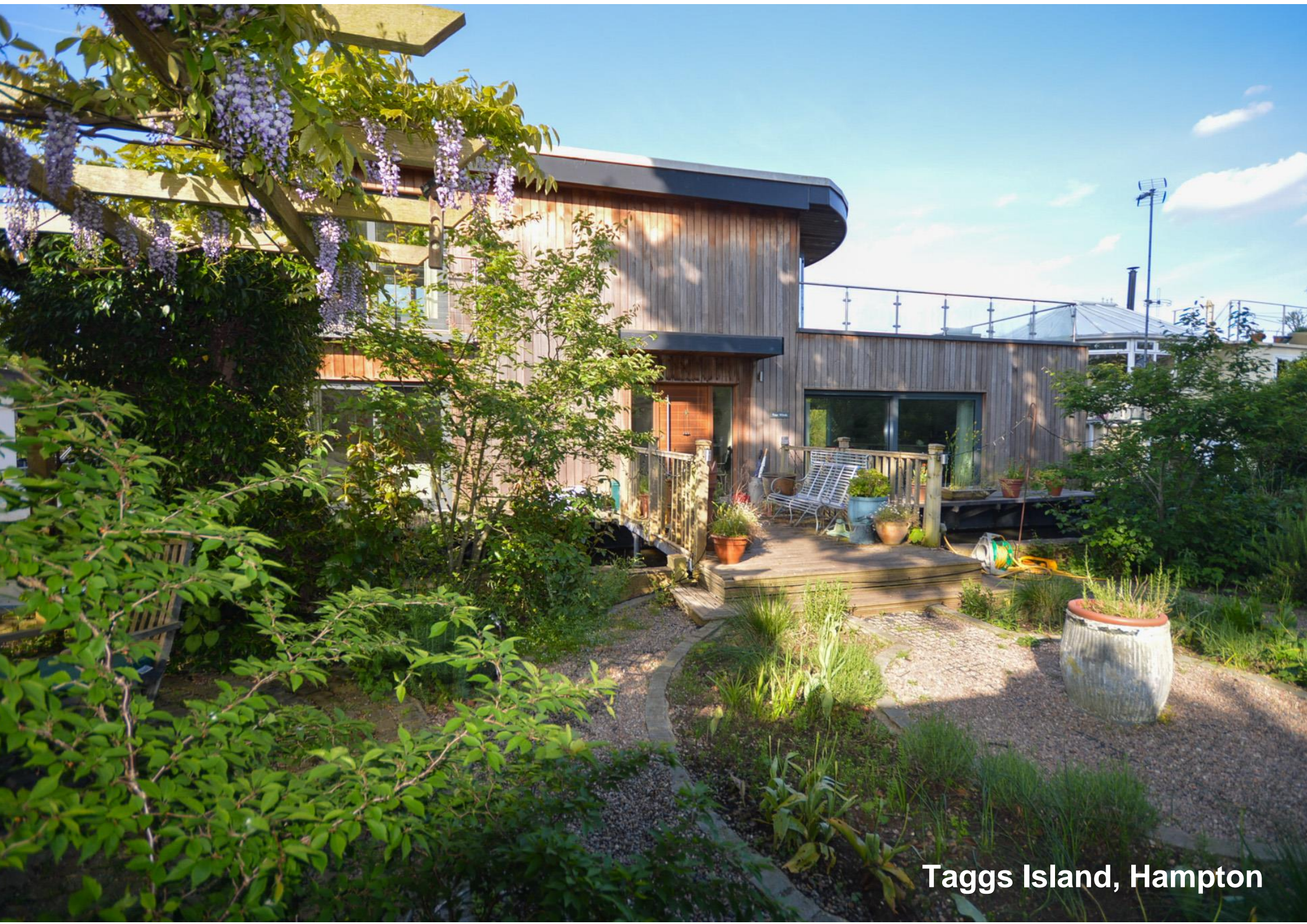
Taggs Island, Hampton