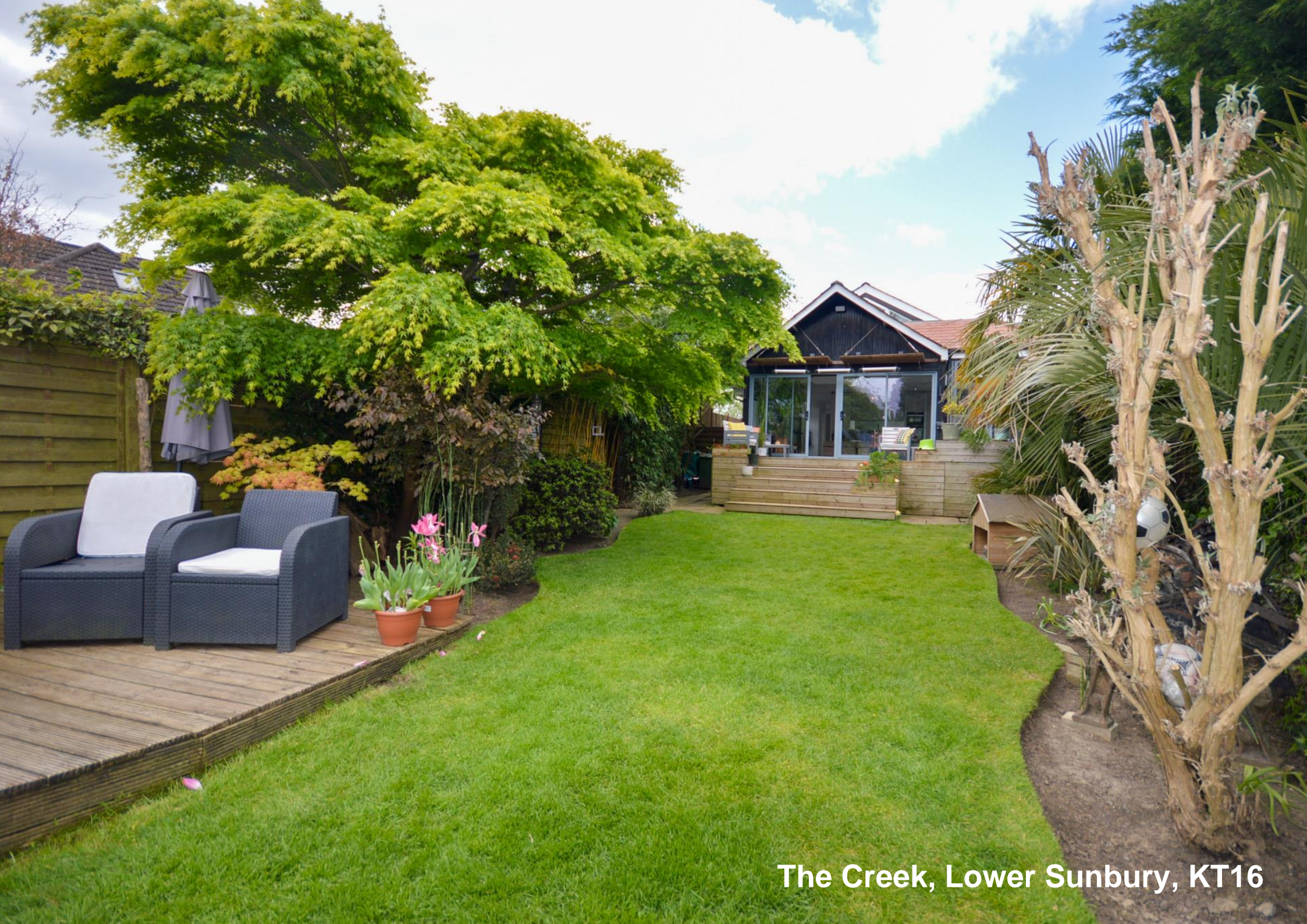
The Creek, Lower Sunbury, KT16