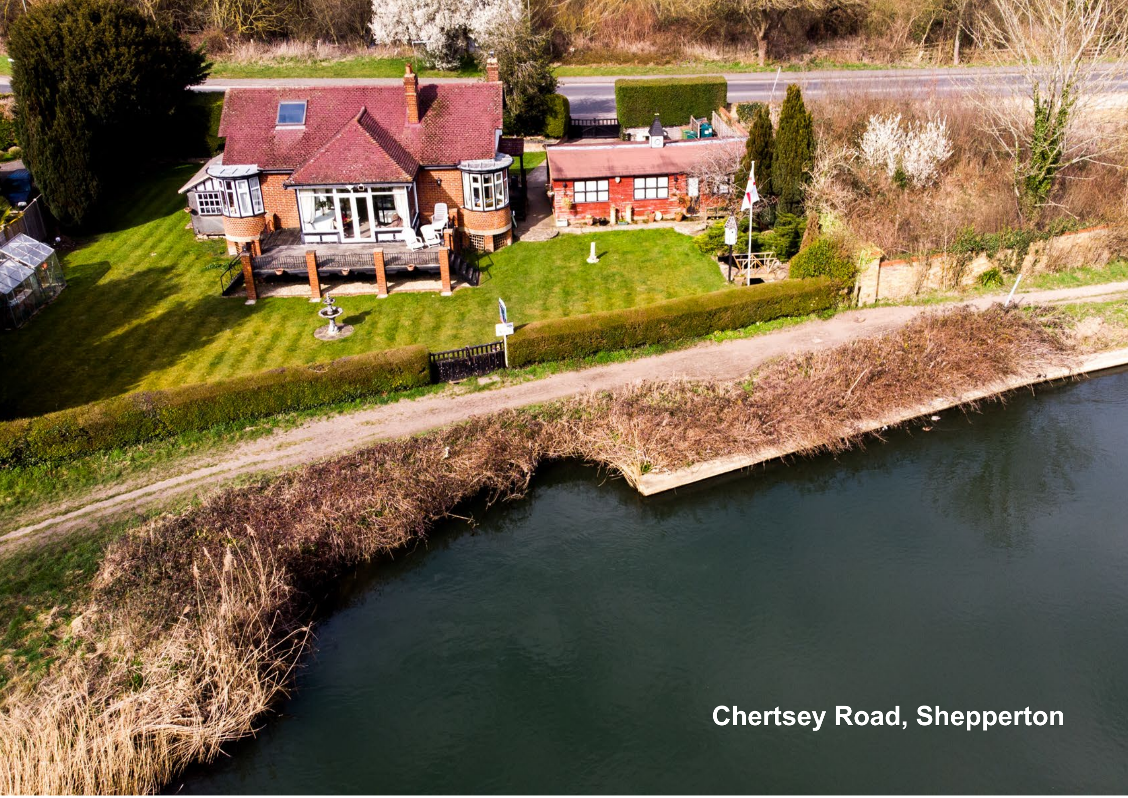
Chertsey Road, Shepperton