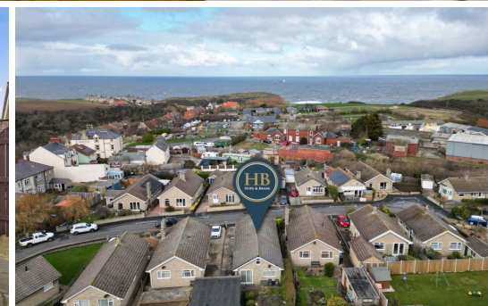
8 FAIRFIELD ROAD, STAITHES- 3 bed Detached Bungalow -£235,000