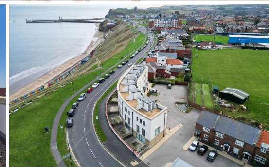
5 MOORLAND CLOSE, WHITBY- 4 bed Town House -£795,000