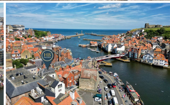
3 HARBOUR VIEW, WHITBY- 1 bed Apartment -£165,000