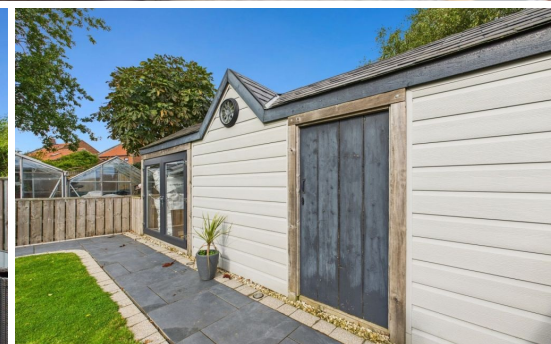
9 MOOR CLOSE, MOORSHOLM- 3 bed Semi-Detached House -£310,000