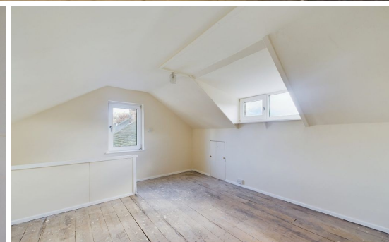
9 OSWY STREET, WHITBY- 3 bed End of Terrace House -£160,000