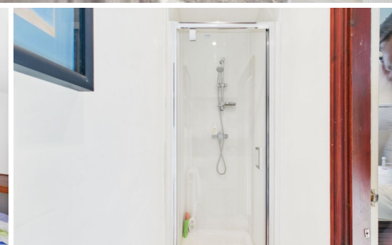
6 GEORGE STREET, WHITBY- 4 bed Terraced House -£199,950