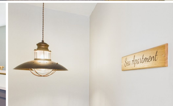
SEA APARTMENT, 6 BRIDGE STREET- 2 bed Apartment -£225,000