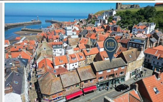
SEA APARTMENT, 6 BRIDGE STREET- 2 bed Apartment -£250,000