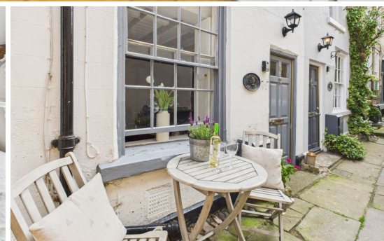
BAKEHOUSE COTTAGE, ROBIN HOODS BAY- 2 bed Cottage -£350,000