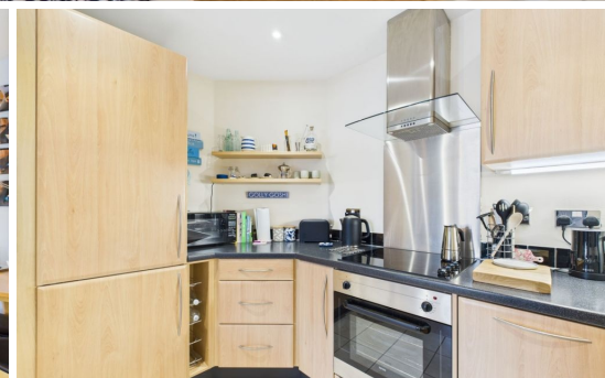
17 ST.JOHNS, ALBION PLACE- 2 bed Apartment -£215,000