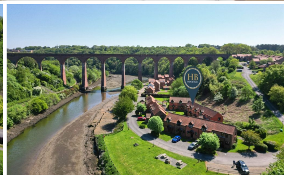
21 ENDEAVOUR COURT, WHITBY- 2 bed Cottage -£169,950