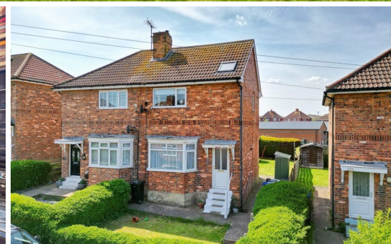
123 ST.PETERS ROAD, WHITBY- 3 bed Semi-Detached House -£170,000