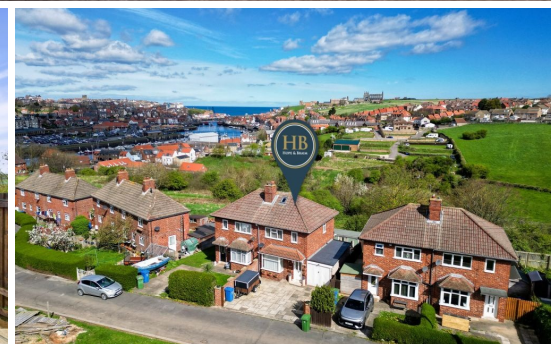
9 ABBOTTS WALK, WHITBY- 2 bed Semi-Detached House -£189,950