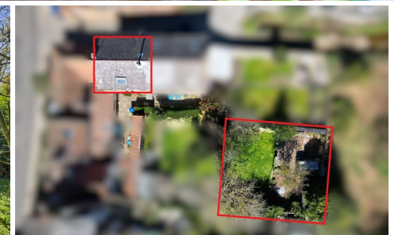
ARCH COTTAGE, RUSWARP- 2 bed Cottage -£220,000