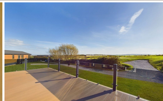
STAG LODGES HOLIDAY PARK, WHITBY- 3 bed Lodge -£365,000