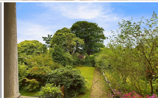
FLAT 1, 16 ST.HILDA'S TERRACE, WHITBY- 1 bed Apartment -£175,000