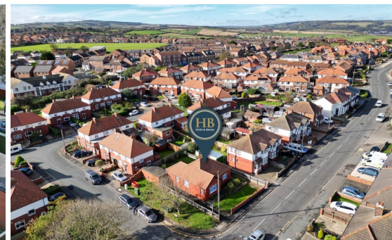
71 UPGANG LANE, WHITBY- 2 bed Detached Bungalow -£295,000