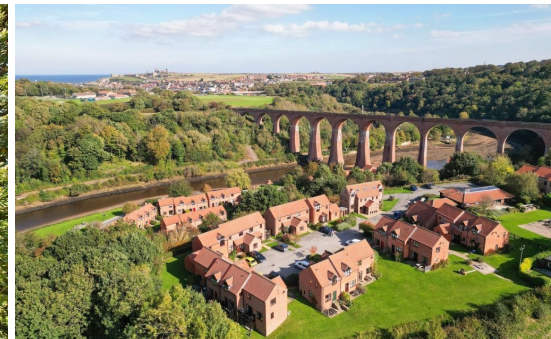
36 RESOLUTION CLOSE, CAPTAIN COOKS HAVEN- 2 bed Cottage -£179,950