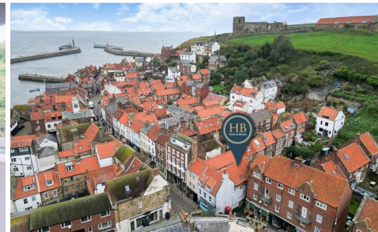
CRYSTAL COTTAGE, CHURCH STREET, WHITBY- 2 bed Cottage -£325,000