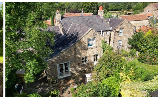
ROSE COTTAGE, IBURNDALE- 3 bed Cottage -£365,000