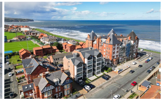
ARGYLE COURT, WHITBY- 2 bed Apartment -£317,500