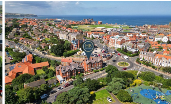
FLORA APARTMENT, 2 CHUBB HILL, WHITBY- 2 bed Apartment -£289,950