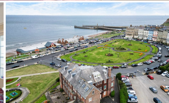
FLAT 15, 19 ROYAL CRESCENT, WHITBY- 2 bed Apartment -£199,950